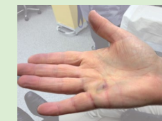
1 week after injection and manipulation

CORD (Collagenase Option of Reduction of Dupuytren's) I & II were randomised double blind placebo controlled studies involving 374 patients with a contracture. 64% of patients had a successful correction when treated with collagenase compared to 5.4% who received placebo.